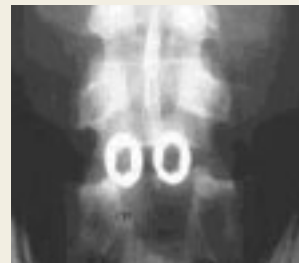
Figure 1: Post-op AP view of titanium cylindrical cages