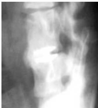
Figure 6: Lateral radiograph of Grade 5 fusion in a monkey's spine with evidence of anterior remodeling with the Ionic vertebral spacer in place.

assessing fusion post-operatively, and the femoral rings often are supplemented with additional fixation because of their limited initial biomechanical stability. (Figure 3)