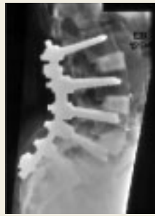
Figure 3: Lateral radiograph of a multi-level fusion with allograft femoral rings supplemented with posterior instrumentation.