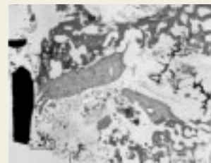
Figure 2: Histology demonstrating necrotic bone and fibrous tissue from an explanted cylindrical cage which had developed a pseudarthrosis

Multi-level fusion procedures are now often performed with a combined anterior/posterior approach in order to attain satisfactory fusion rates.